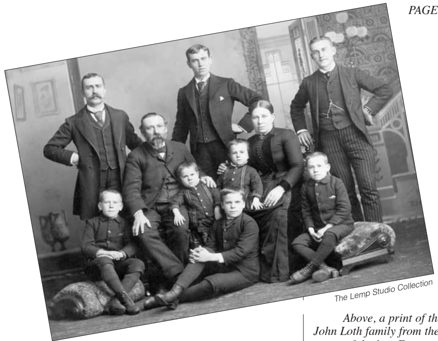
The Lemp Studio Collection

Earlier this year we offered a workshop for beginner genealogists. More workshops are on the drawing board for 2006. Please let us know if you have a specific interest .... e.g. how to begin