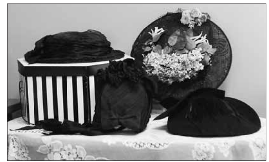
Millinery items now on display

Oral History Library is growing with DVDs of local interviews with individuals who have much knowledge of our history. The committee has plans to expand this Library including many historical facts and information from individuals and corporations. The Year of the Veteran project has turned out to be a much larger undertaking than first visualized. It has now extended into its second year of collecting names, data and photos from families and friends of Veterans of the Boer, First & Second World Wars and other conflicts in which our Canadian Veterans were involved. We have produced a DVD of their photos