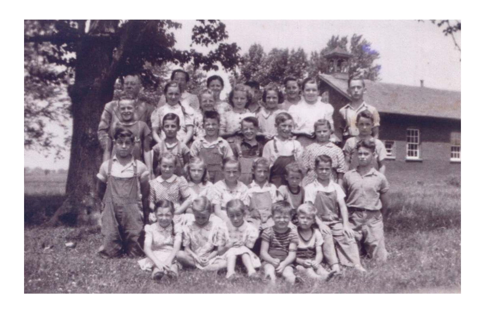
S.S. No. 13 - year not known