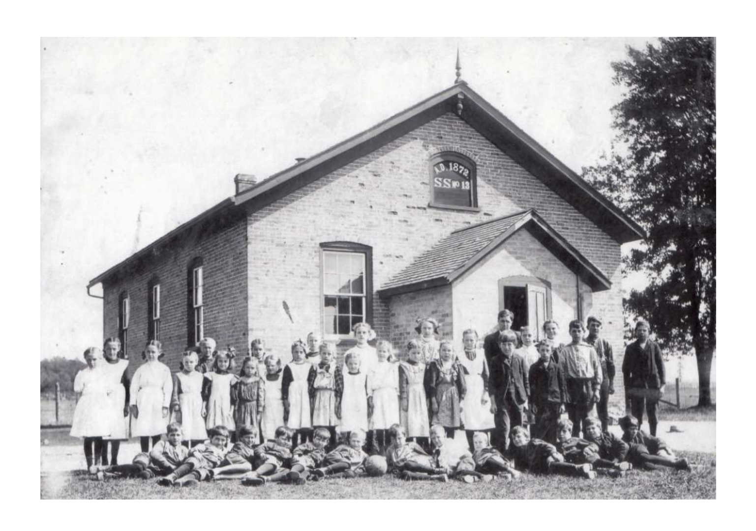
S.S. No. 13 - possibly 1909