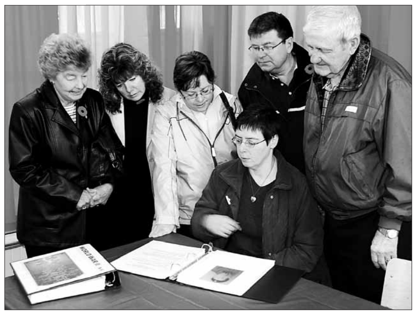
The Wilks family views Veterans Project books at the Library Hall display.